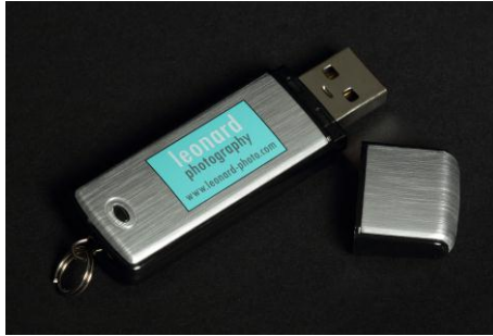
Your digital photos are supplied on a USB Key

These packages are ideal for a couple looking to get extensive coverage of their day, have unrestricted access to all the digital photos and have a password protected web gallery to share photos with friends and family. You can always add a wedding album at a later date – see page 3 for our album options.